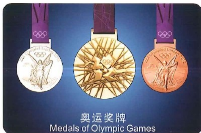
奥运奖牌 Medals of Olympic Games